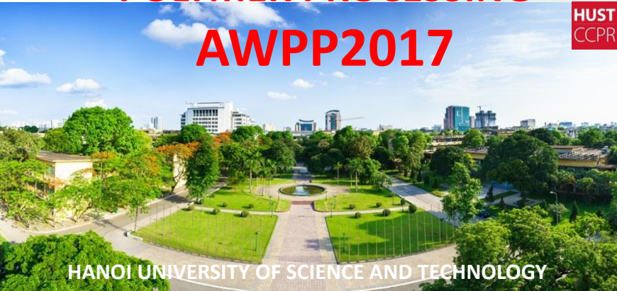
HANOI UNIVERSITY OF SCIENCE AND TECHNOLOGY

The Asian Workshop on Polymer Processing (AWPP) is an annual workshop. Following the AWPP2010 in Hanoi, Vietnam and previous successful workshops, the 16 th AWPP2017 will be held in HUST, Hanoi, Vietnam from